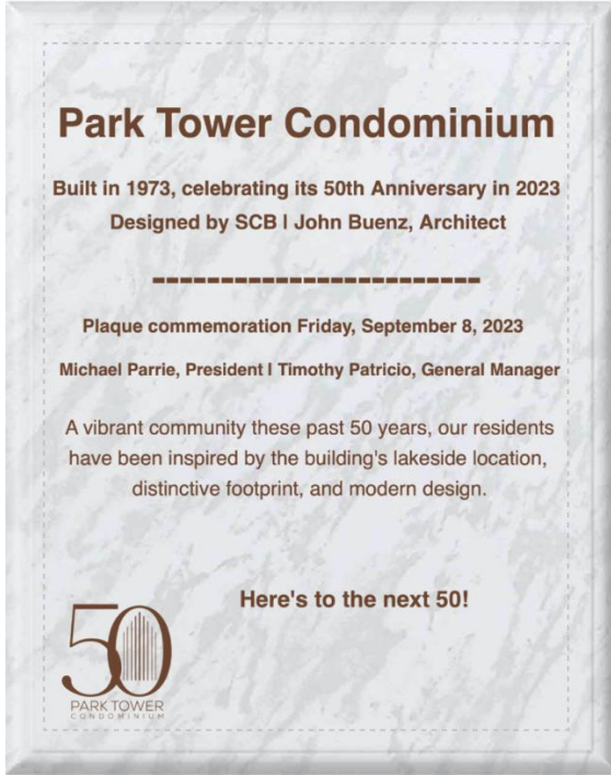
12. Stainless Steel plaque (8x10 portrait), $92