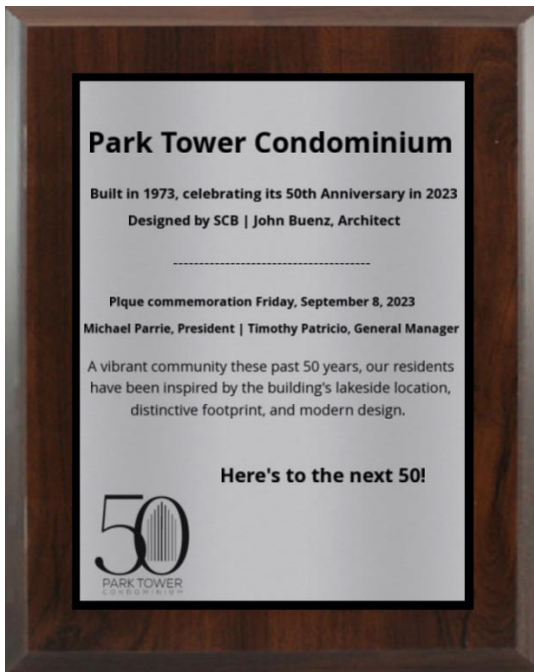
13. Bronze plaque (8x10 portrait), $99