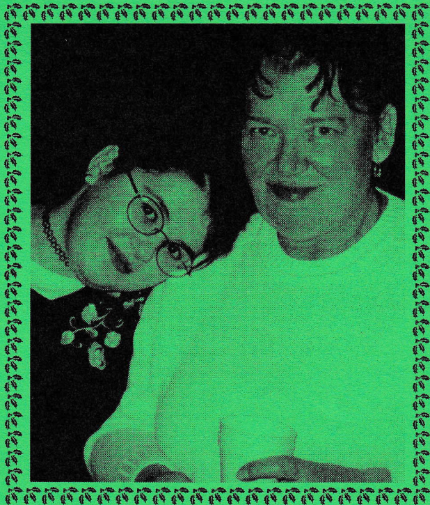
The Volkova family is dreaming of a white Christmas....