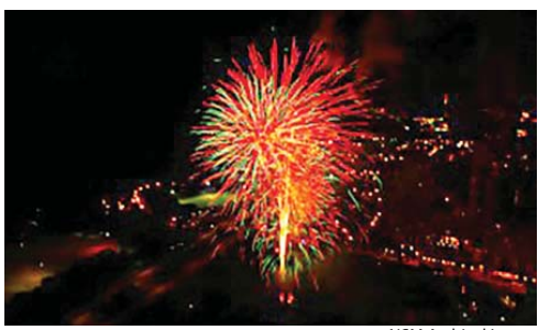
NSM Archival Image

Despite the rainy start to summer this year, Mother Nature cooperated by giving us a wonderfully dry and sunny July 4 afternoon. And the stiff breeze off the Lake? Well, it sure kept the mosquitoes away!