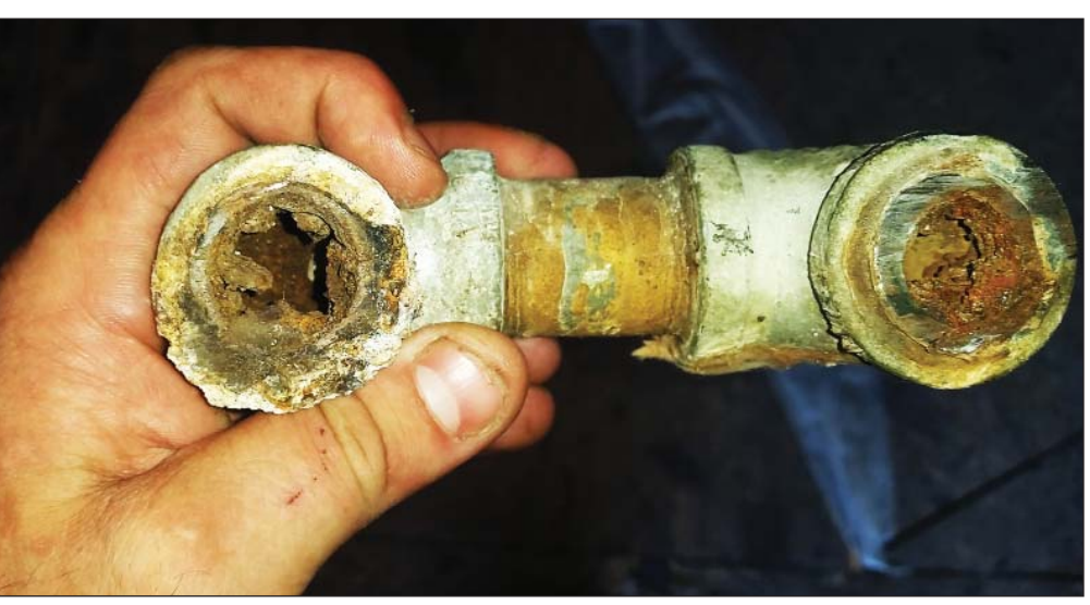
Typical condition of deteriorated pipe.