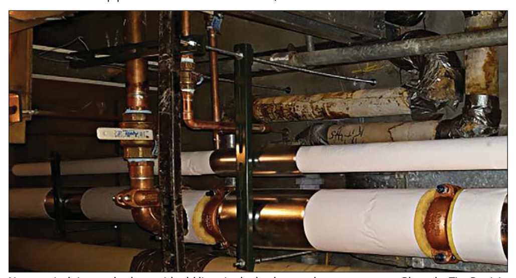
New vertical riser and valves, with old lines in the background.