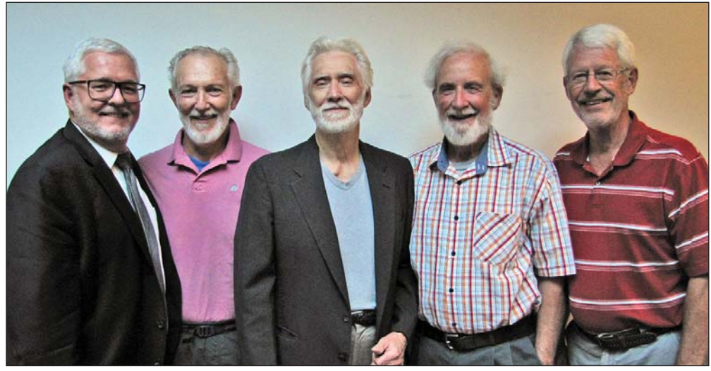
See the answer on who's who below.

These improvement, added to the jazz she listens to while sorting, will make the facilities ever so much more comfortable and inviting.