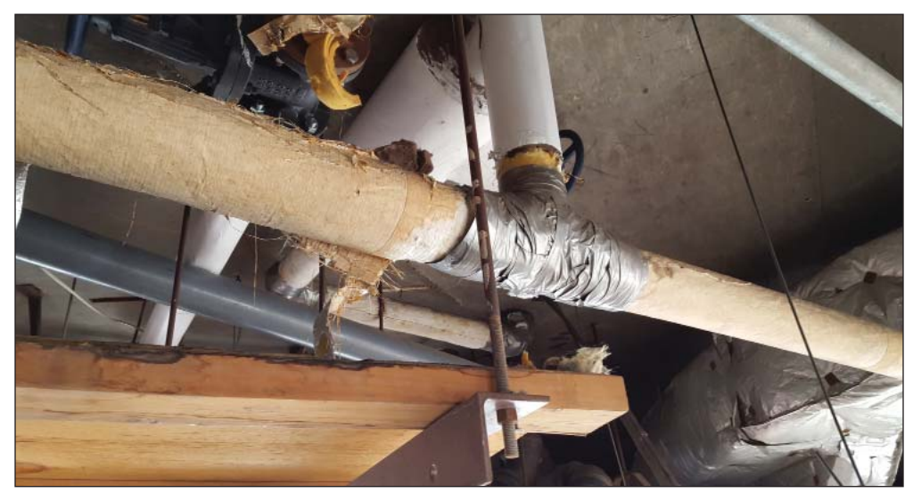
A typical vertical riser prior to replacement project.

What caught our attention early on, while replacing risers, was that those supply and waste loops were nearing the end of their useful lives. The loops were so fragile that just touching them could compromise their integrity and result in a leak. And the valves were functionally obsolete – which we learned in early August when we attempted unsuccessfully to